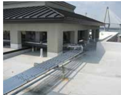
Renaissance on Charleston Harbor Condos Charleston, SC