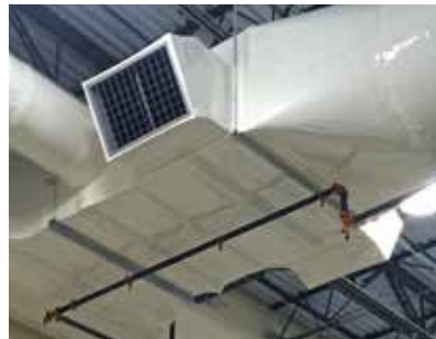
American Snuff Company Factory Memphis, TN